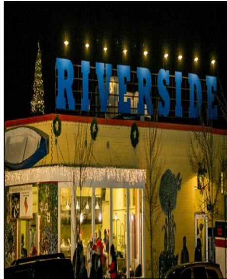
Washington Parks & People Riverside Healthy Living Center