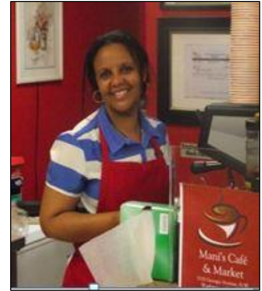
Mani's Café & Market